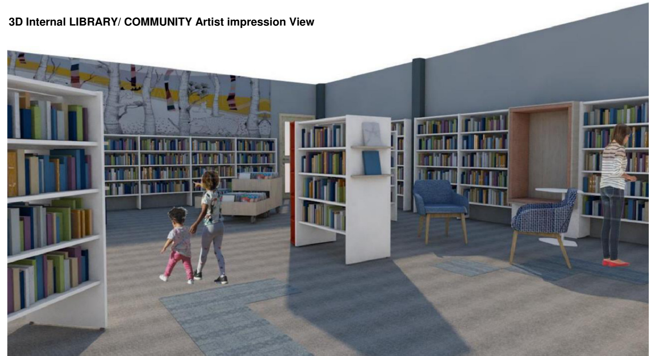
3D Internal LIBRARY/ COMMUNITY Artist impression View