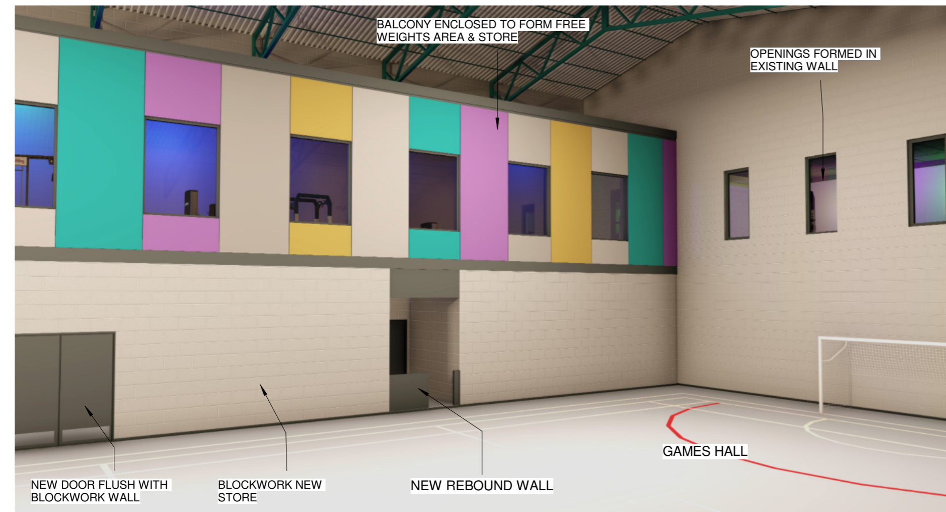
3D Games Hall, Balcony enclosure free weights Artist impression View