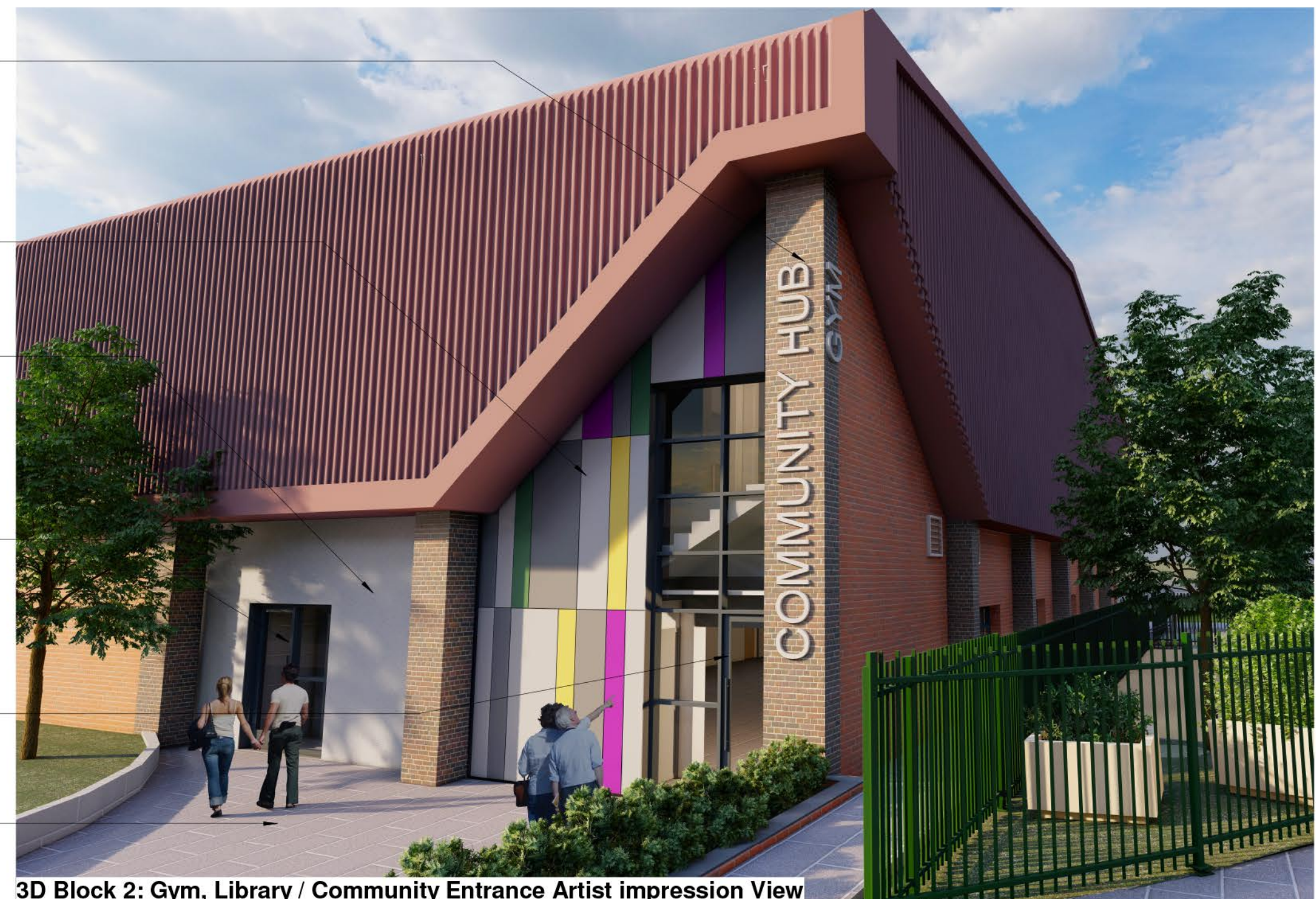
3D Block 2: Gym, Library / Community Entrance Artist impression View