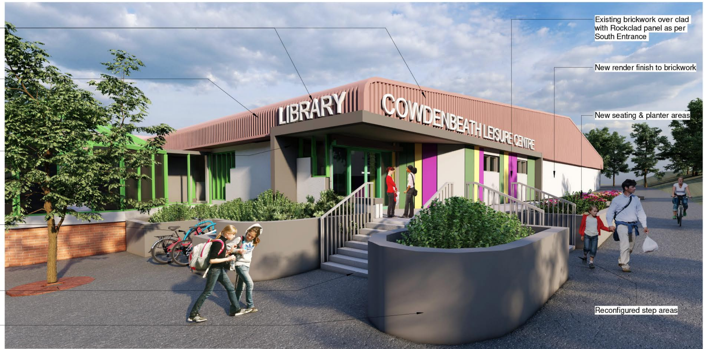
3D Block 1: Main Entrance Artist impression View

Existing brickwork over clad with Rockclad panel as per South Entrance